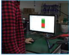
Parameter and Performance Testing