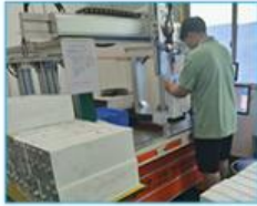
Battery Cell Testing and Matching