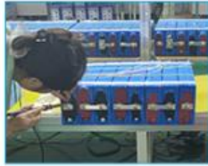
Assembling Battery Pack